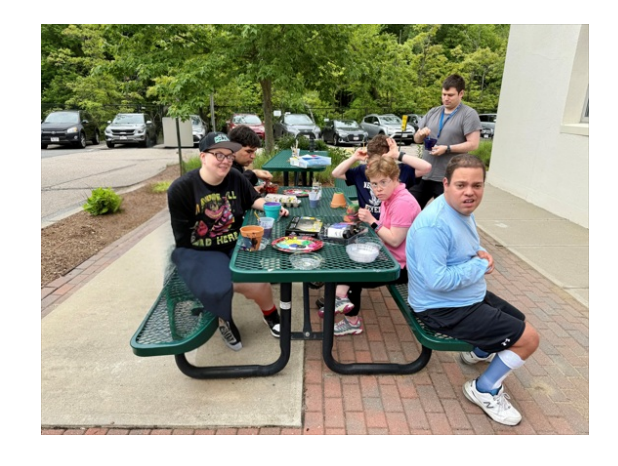
Specialized Supports took advantage of the lovely weather and made some outdoor crafts!

It's nearly summertime, and our programs have been loving the warm weather! Take a look at just a few of the ways we've been welcoming the summer months.